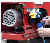
OPTIONAL Dual Voltage AC Motor