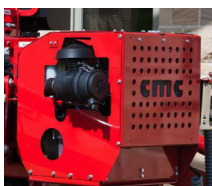
OPTIONAL Kubota Diesel Engine