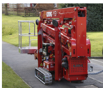
Single Doorway width (780mm)