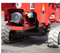
Hydraulic Extending Tracks