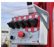
Simple Control System