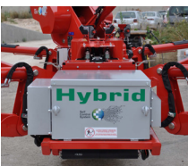
OPTIONAL Hybrid Power Source