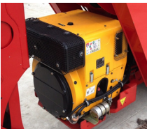
Silent Pack Diesel Engine