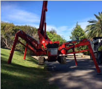
Spider Style Stabilisers