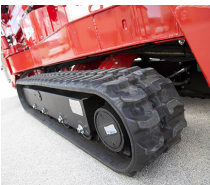
Extending Width Tracks