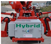
OPTIONAL Hybrid Power Source