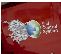
Self Control System