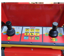
Simple Control System