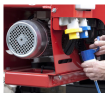
OPTIONAL Hybrid Power Source