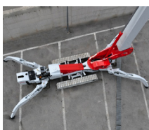
Narrow Stabiliser Setup