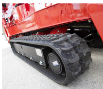
Hydraulic Extending Tracks