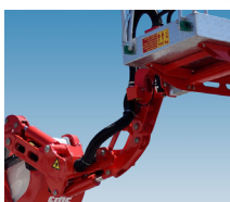
Innovative Boom Design