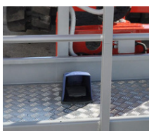
"Dead Man" Safety Device in Basket