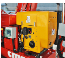
Hatz Silenced Engine