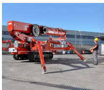
Remote Control Station