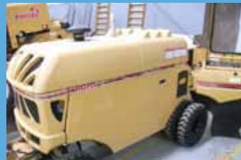
RAYCO RG 70 Self Propelled Stump Cutter, 12 month warranty $54,900 including GST.