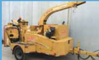
RAYCO RC 16.5 Wood Chipper 17" 1835 Hours, $48,400 including GST.