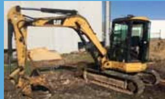
CATERPILLAR 305CR Excavator 5 tonne, grapple, 4 buckets $43,890 including GST.