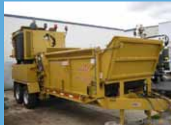
RAYCO RH 1754-240 HP Horizontal Grinder, Ex-Demo, $249,900 including GST.