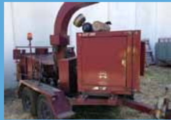
AUSTCHIP 225 Diesel Wood Chipper, 9" chipping capacity, $13,990 including GST.