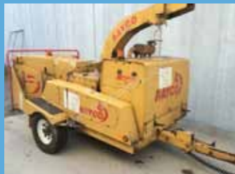
RAYCO RC12 2006 model chipper low hours, $27,500 including GST.