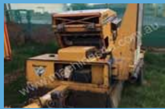
VERMEER SC502 tow behind stump grinder, as traded $3,550 including GST.