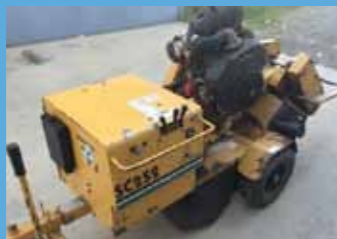
VERMEER SC252 stump grinder, 1008 hours, $8,900 including GST.