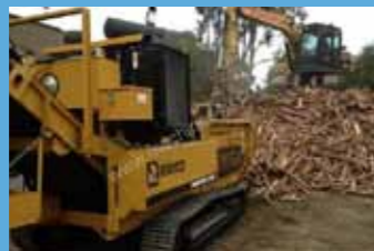
RAYCO RH 1754 240 HP Horizontal Grinder, Ex demo $297,000 including GST.