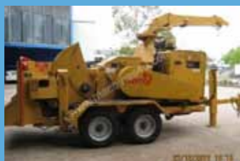
RAYCO RC20 XP 20" chipper 1655 hours $59,900 including GST.