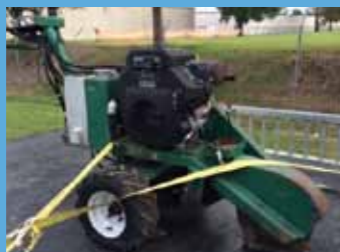
AGTRAK Stumpmaster Series 2, 20hp Kohler engine, $8,500 including GST.