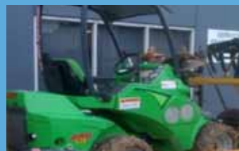
AVANT 528 LOADER Ex-Rental, 230 hours, $41,800 including GST.