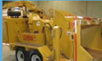
RAYCO RC 20XP Diesel Wood Chipper, 1655 Hours, $59,900 including GST.