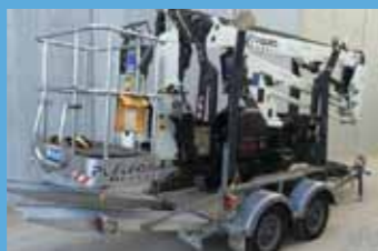
MONITOR 18.90 Spider Lift, Ex-Demo, with trailer $85,000 including GST.