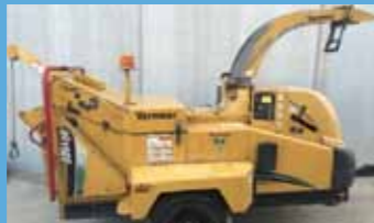
VERMEER BC1500 Diesel Wood Chipper, 1468 Hours, $34,900 including GST.