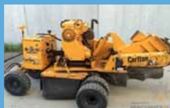
CARLTON 4400D Stump Cutter, Starts, runs, as traded, $8,900 including GST.