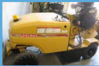
RAYCO RG 1635 Self Propelled Stump Cutter, 850 hours $13,750 including GST.