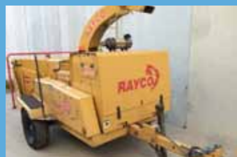
RAYCO RC12 Wood Chipper, excellent condition, $29,900 including GST.