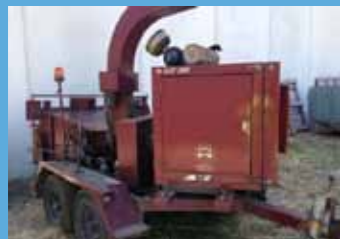
AUSTCHIP 225 Diesel Wood Chipper, 9" chipping capacity, $16,900 including GST.