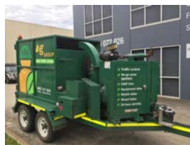
2002 6 Inch AustChip Diesel Combo $29,900.00 Inc GST