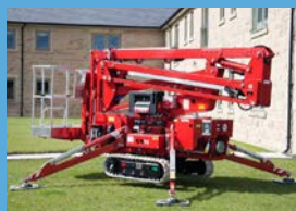
2017 CMC S15 Own Today from, $311.27 Per Week*