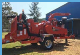
Morbark M18R Own Today from, $519.01 Per Week*