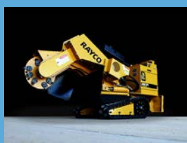
Rayco RG37T Own Today from, $163.33 Per Week*