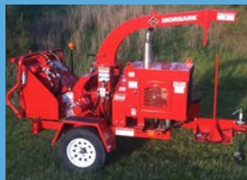
Morbark M8D Own Today from, $195.35 Per Week*