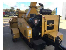
2016 Rayco RC1824 Diesel Wood Chipper $109,990.00 Inc GST