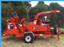
Morbark M15R Own Today from, $415.14 Per Week*