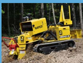
Rayco RG45T Own Today from, $297.42 Per Week*