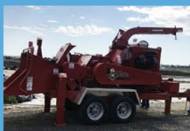
Morbark M20R Own Today from, $1,003.74 Per Week*