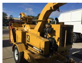
2015 Rayco RC1220 Diesel Wood Chipper $69,900.00 Inc GST