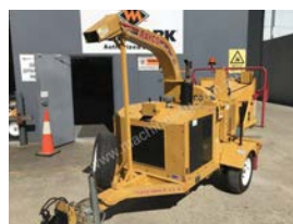
2010 Rayco RC814 Diesel Wood Chipper $32,900.00 Inc GST