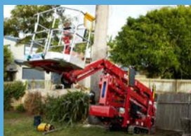
2017 CMC S19 Own Today from, $415.14 Per Week*