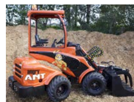
2015 Angry Ant DY840 Mini Loader $35,900.00 Inc GST